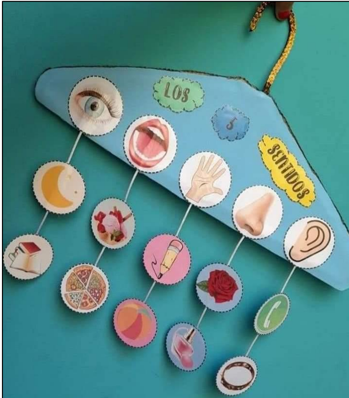
(Pic - 3)